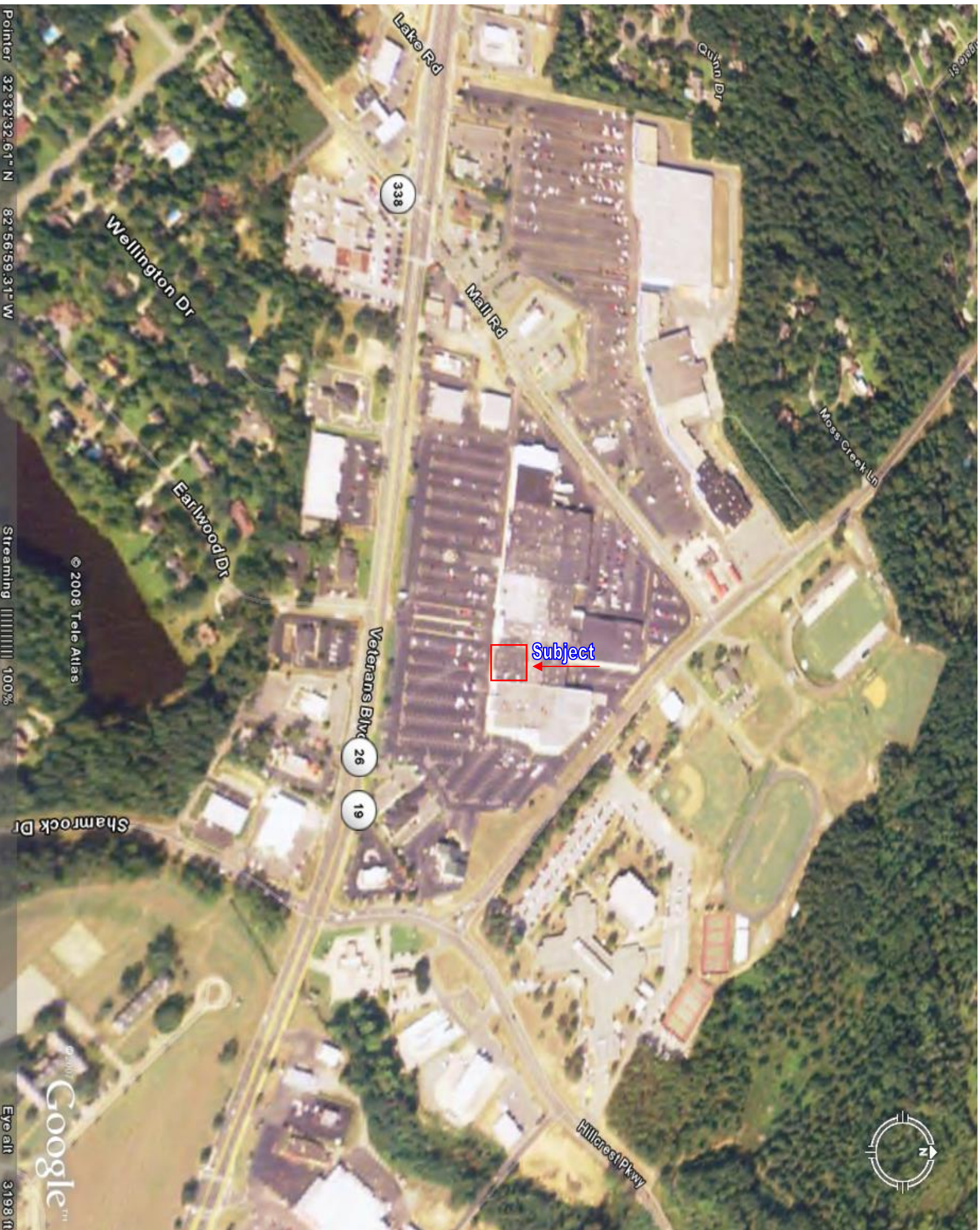
This information is from resources deemed to be reliable, no warranties or guarantees for accuracy are made by Fickling & Company