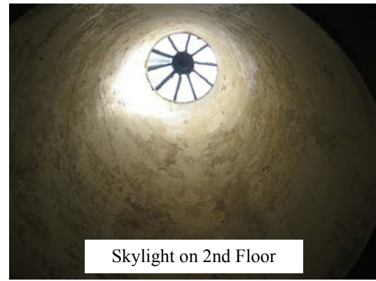
Skylight on 2nd Floor