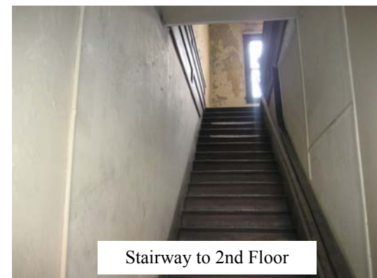
Stairway to 2nd Floor