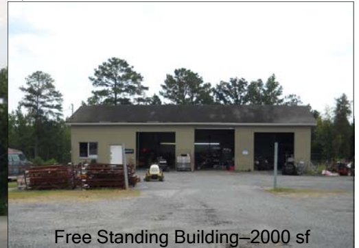
Free Standing Building—2000 sf

Sale Price: $495,000 Lease: $3,500 / month NNN for all of property or see below for multi-tenant options.